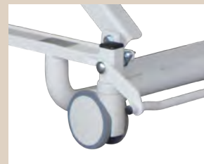
CLOK Central Locking Castors - Twin Wheel 125mm