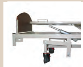
VSE Electric Vascular Support

* Must be fitted at time of manufacturing