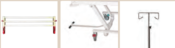
C.EXT1070 200mm Clip On Extension