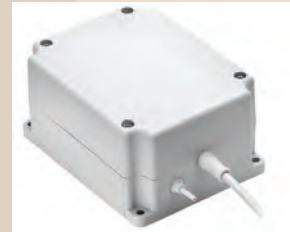
ABB Battery Backup