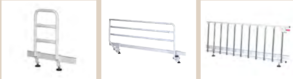
CLP400 Clamp On Support Rail 400mm