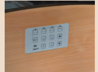
ACK Attendant Control * Must be fitted at time of manufacturing