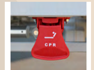
CPR Emergency Release