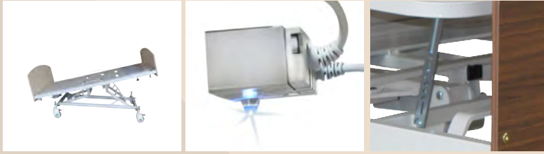
Forward and Reverse Trendelenberg