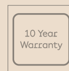
10 year frame warranty