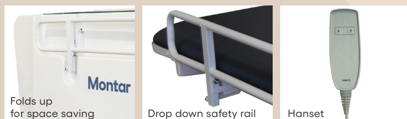
Folds up for space saving