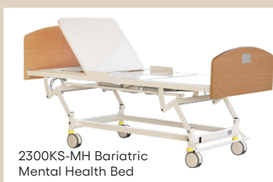
2300KS-MH Bariatric Mental Health Bed