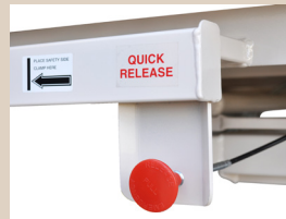
CPR Emergency Release