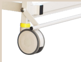
CL2000W 125mm Central Locking Castors