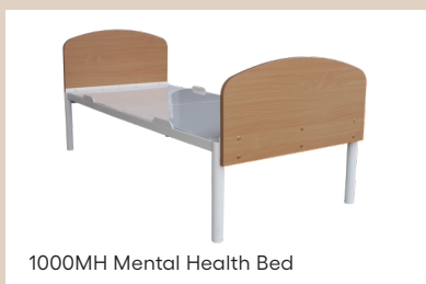
1000MH Mental Health Bed