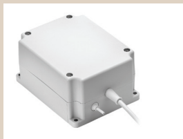
ABB Battery Backup